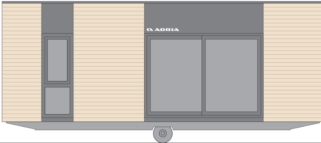
MLine 804 F22